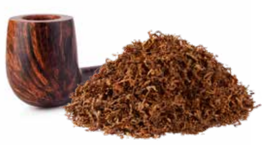
PIPE TOBACCO BLENDS

In other words, the Airco DIET process will increase your economic gain as well as the quality of your tobacco product. That is why we call Airco DIET a 360° refinement solution.